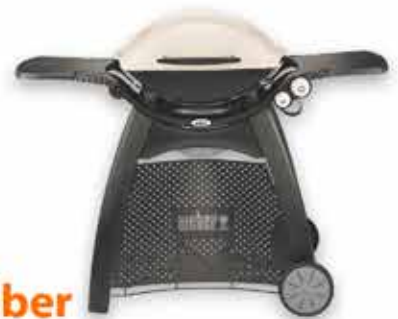
Weber Q 3100 LP BBQ Titanium (also in black) 318131