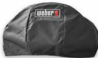
Weber Premium BBQ Covers Assorted SKUs