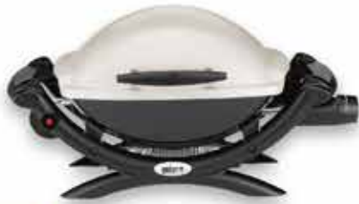
Weber Baby Q 1000 BBQ Titanium (also in black) 318130