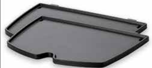
Weber Half Hot Plates Assorted SKUs

Mitre 10 MEGA Westgate & Henderson Northside Drive & Lincoln Road Monday to Friday: 7am - 7pm Weekends: 7am - 7pm